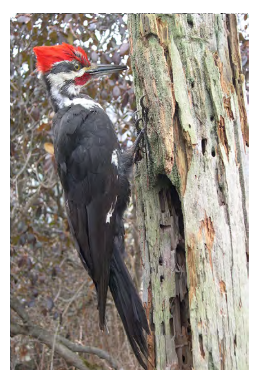
Pileated Woodpecker.